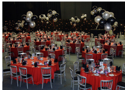
Balloons provided by MJR Balloons .

For more information on our menus please contact our Conference & Events Team on 01438 242679 or email us on conference@stevenage-leisure.co.uk .